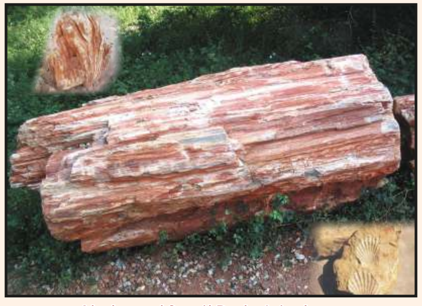
Akal wood fossil Park, Jaisalmer