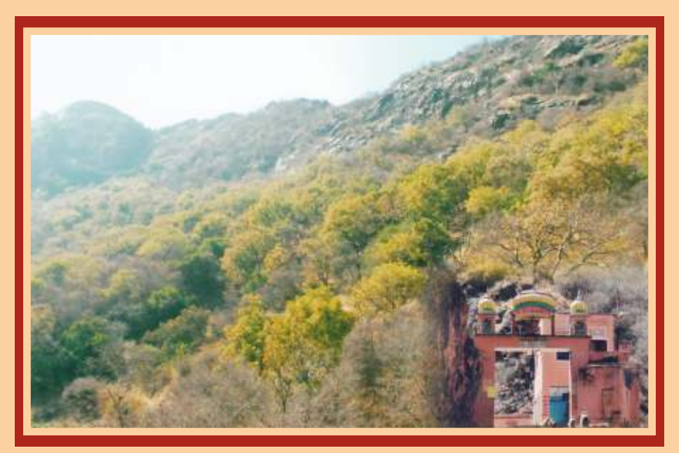
Chappoli-Mansa Mata, Jhunjhunu